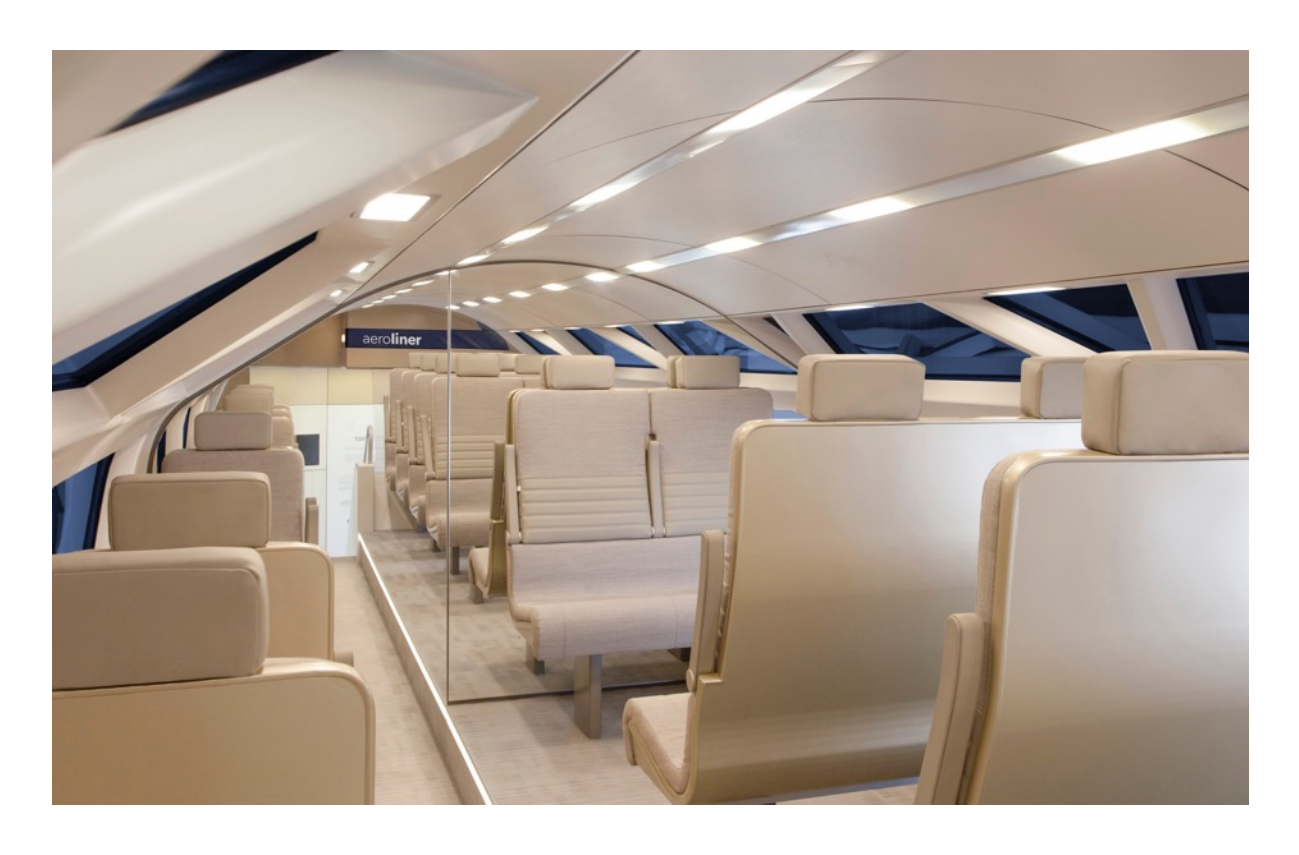
The Interior of the AeroLiner3000: A new lightweight construction allows large windows and a