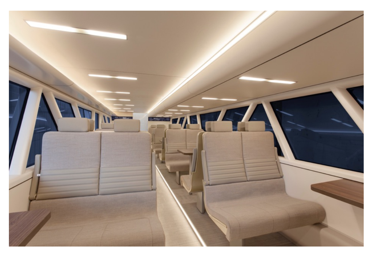
The Interior of the AeroLiner3000 - Elegant shapes, neutral warm colours and noble materials form a classy travel ambience.