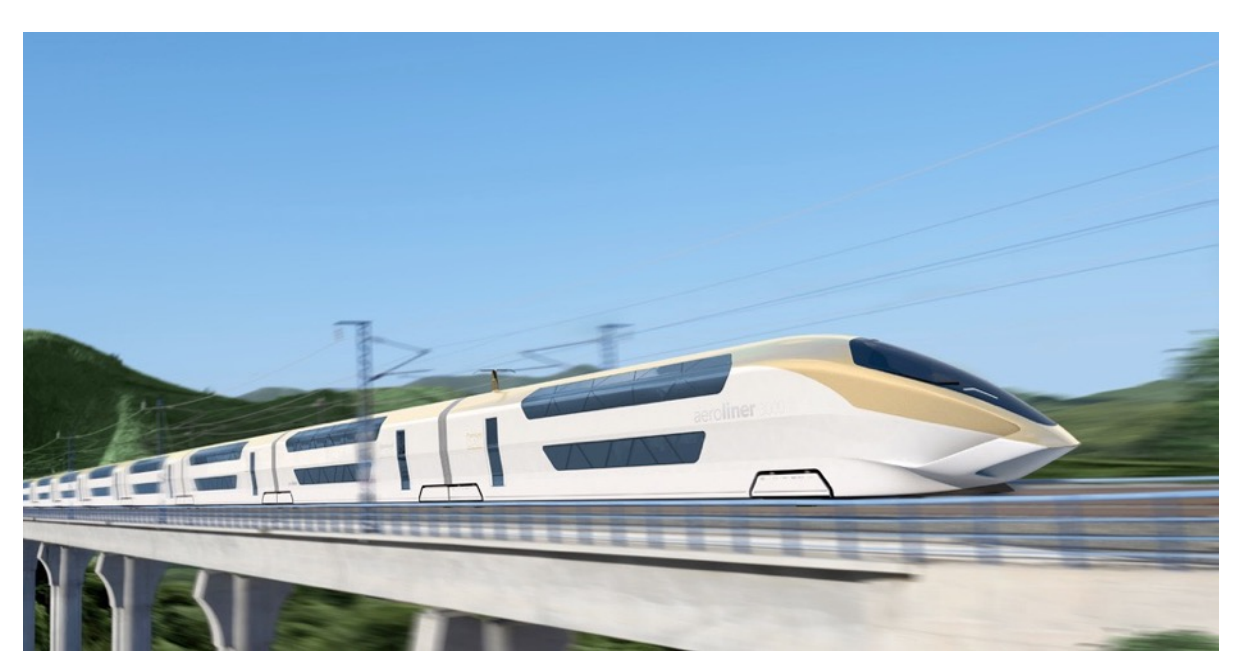
AeroLiner3000 - The double-deck high-speed train, designed by the architecture and design office Andreas Vogler Studio in collaboration with the German Aerospace Center (DLR) promises more passengers, less noise and lower CO2 emissions. Copyright: Andreas Vogler Studio