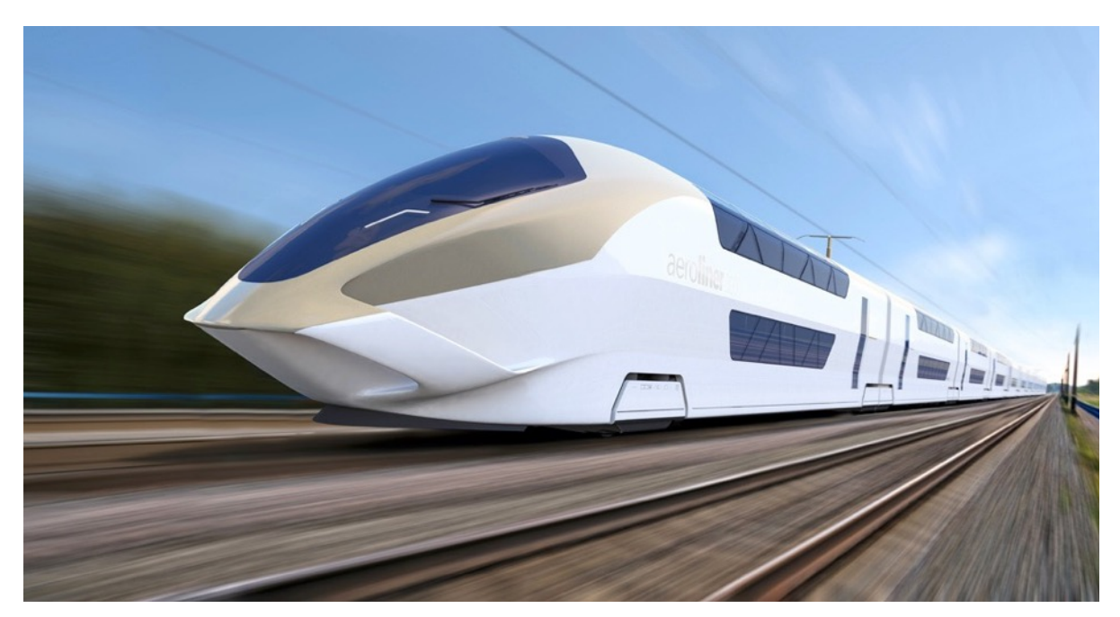
AeroLiner3000 - with aerodynamics, elegance and efficiency into the future. The first modern double-decker train on British tracks, which are highly limited by their narrow gauge.